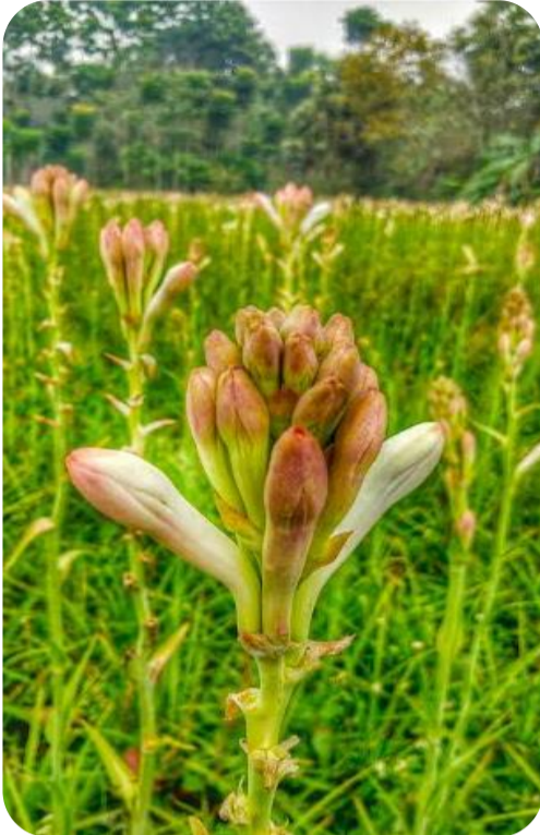
It is time to 'BLOOM'