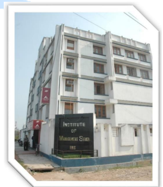
Institute of Management Study Campus Mukundapur, Kolkata, West Bengal