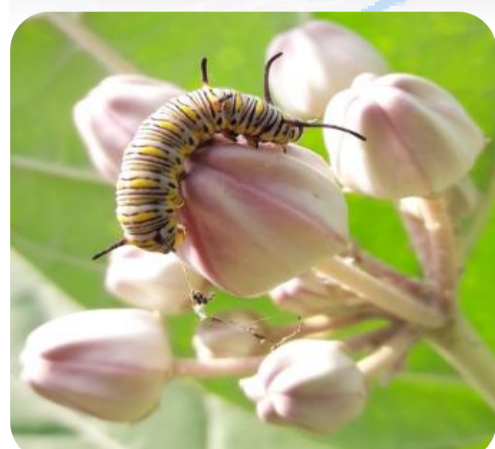
"Never stop fighting until you arrive at your destined place"