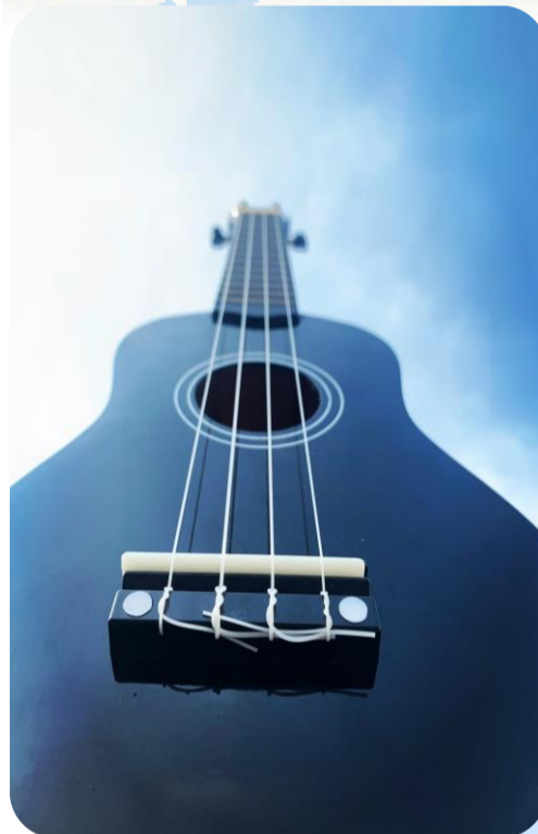
"Music is an outburst of the soul."