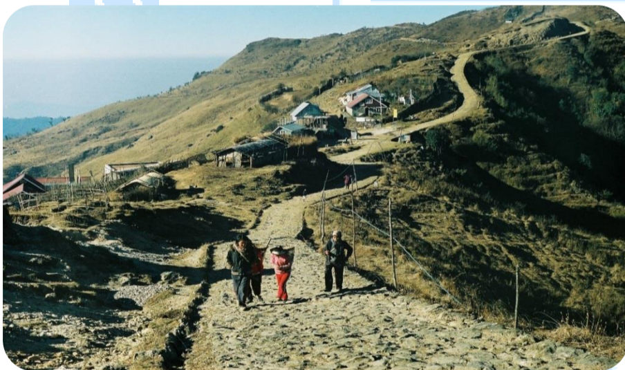
Life at Tumbling, West Bengal