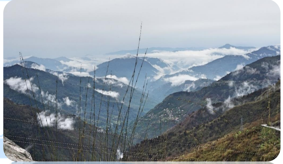
Nature will always give you a sense of belonging